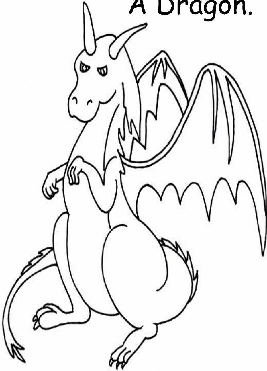
A Dragon lives in a cave.